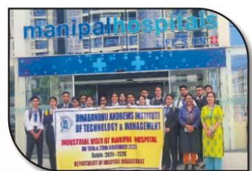
Industry Exposure Visit For BBA (HM) Page-2