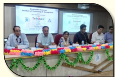
Innovating Together : Daitm Hosts Techquest 1.3 with IQAC & IETE Kolkata Page-6