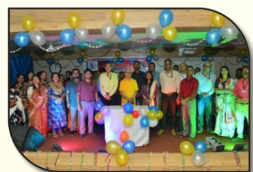
Happy Teachers' Day: A Tribute to Mentorship Page-4