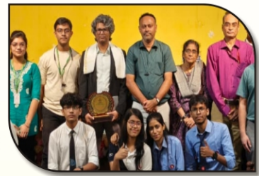
72nd Foundation Day of IETE Kolkata Centre Page-3